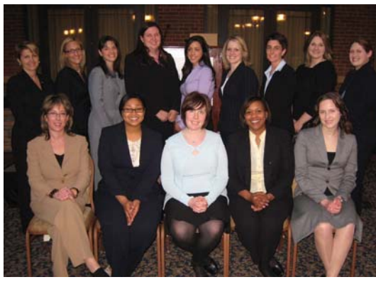
The 2007 Outstanding Women Law Students attending the WLAM Foundation's Annual Awards Reception on March 29, 2007. Profiles of the Awardees appear at www.wlamfoundation.org .

Over 100 attendees of the WLAM Foundation's 2007 Awards Reception gathered on March 29, 2007 at the St. John's Conference Center in Plymouth, enjoying an evening in the Center's lovely Atrium. Attendees celebrated the accomplishments of the 19 Outstanding Women Law Students who were announced and profiled on their accomplishments. Each student-awardee received between $2,000 and $3,750 in awards given in recognition of leadership, or commitment to women's or diversity issues. The awards included four for "Ford Scholars," $3,750 awards underwritten by the Ford Motor Company Fund. This marks the sixth year in which Ford has supported these generous awards. Also awarded this year were five $3,000 awards to "GM Scholars," outstanding women law students who have demonstrated leadership on diversity issues. The remaining ten awards of $2,500 each were given to WLAM Foundation Scholars. Profiles of the students appear on the Foundation's web site, www.wlamfoundation.org .